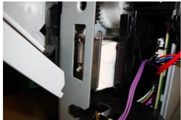
Figure 2 Plate in correct position

If you do have to replace the solenoid, the part number is RK2-1490-000 and we can quickly quote price and availability on this component. Contact your Parts Now sales representative and they will be happy to help. We hope we've cleared up the confusion.